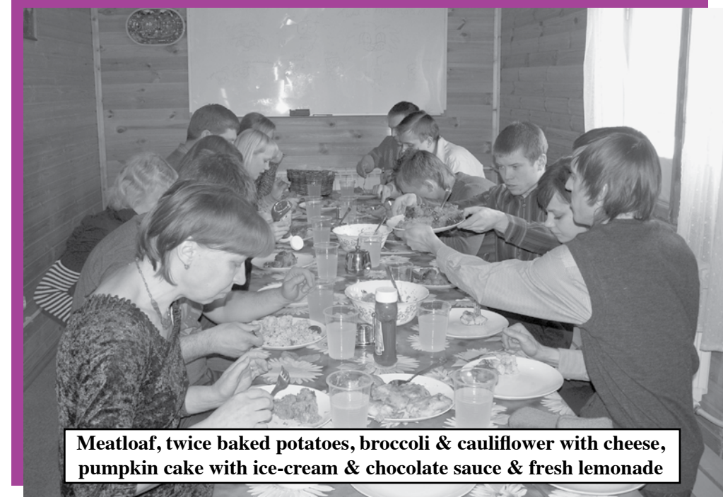
Meatloaf, twice baked potatoes, broccoli & cauliflower with cheese, pumpkin cake with ice-cream & chocolate sauce & fresh lemonade

Kent's son presented him with gifts and a beautiful card signed "Love Son Ilya." The girls made a cardboard frame covered in wrapping paper to create a beautiful picture of Kent holding one of the cakes that they had seen on facebook.com. "This is from all your Little Angels" Yulia and Ira said. And, on the final day the staff gave Kent a