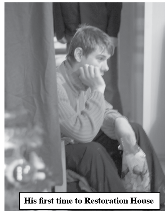
His first time to Restoration House

Then we shared our dreams for a new year. I said that this year I want to learn how to love those who don't love me. Somebody said that he wants God to give him back his family, others wanted their friends and relatives to be healthy and happy. Most of them