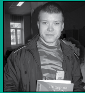
Off to School