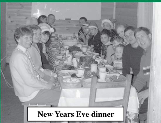
New Years Eve dinner