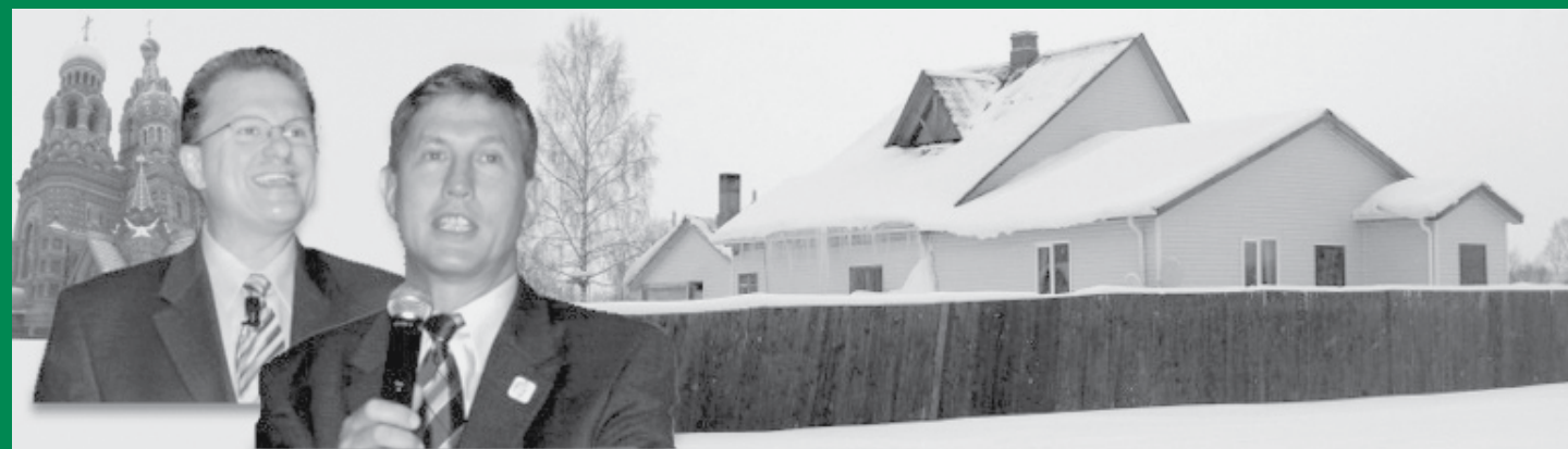
Back from Russia with an update of the work at Restoration House

Then it was out the door to shoot off the fireworks and off to the village New Years Tree where there were more fireworks and a visit from Ded Moroz (Father Frost), Snegurochka (Snow Maiden) and the forest creatures. It seemed like everyone in town