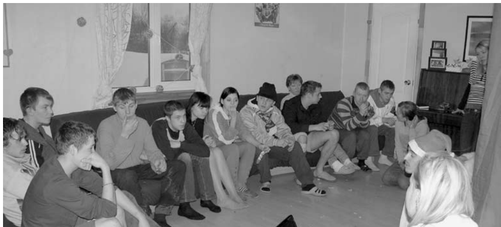
Christmas Party with youth from the street January 7, 2011

came out to play games and greet one another.