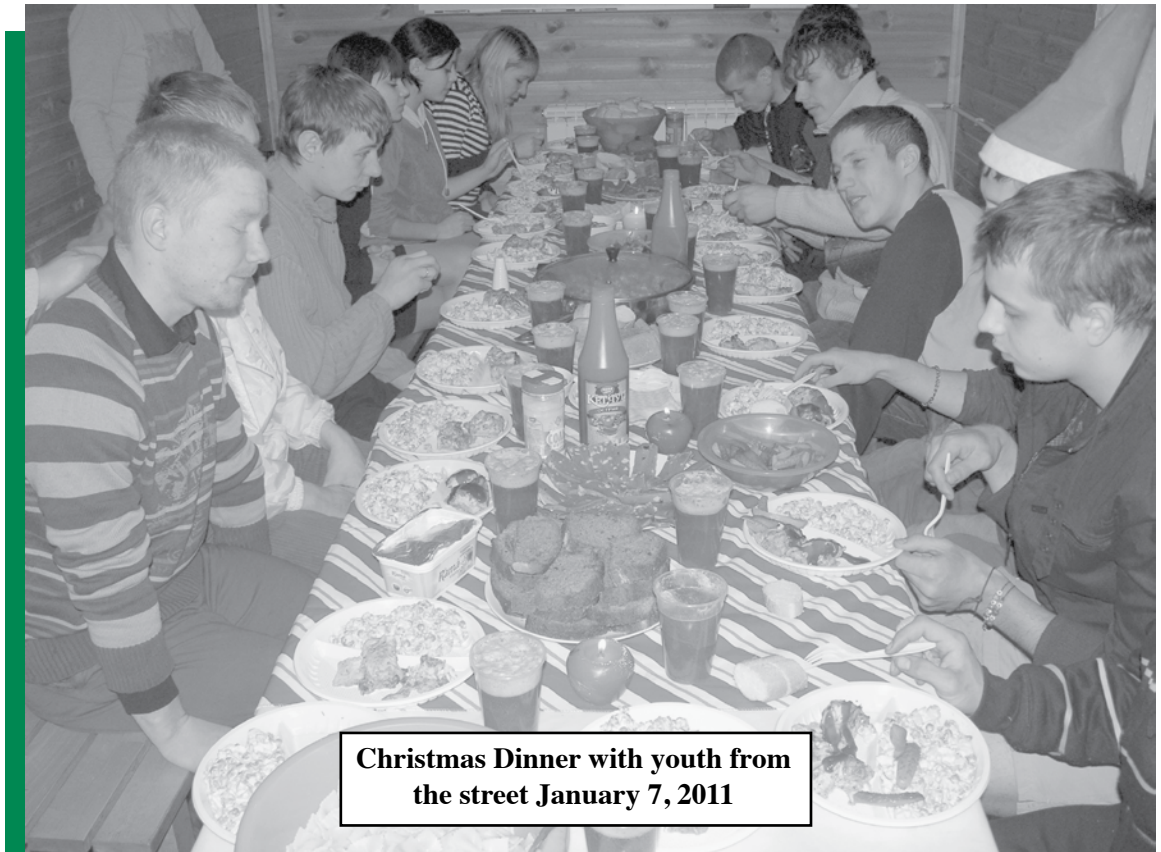
Christmas Dinner with youth from the street January 7, 2011

The family celebration had everything a traditional Christmas would have including a turkey dinner with all of trimmings, the tree with, as one staff put it, "more gifts than I ever received," stockings hung and of course a visit from Santa Claus.