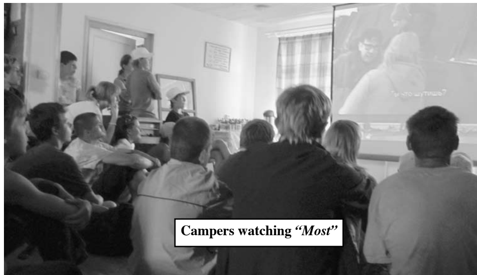
Campers watching "Most"

These sacrifices allow us to keep living our lives and the sad truth is that many of us will make it through our entire lives without realizing how much God truly loves us and how much God has done for us.